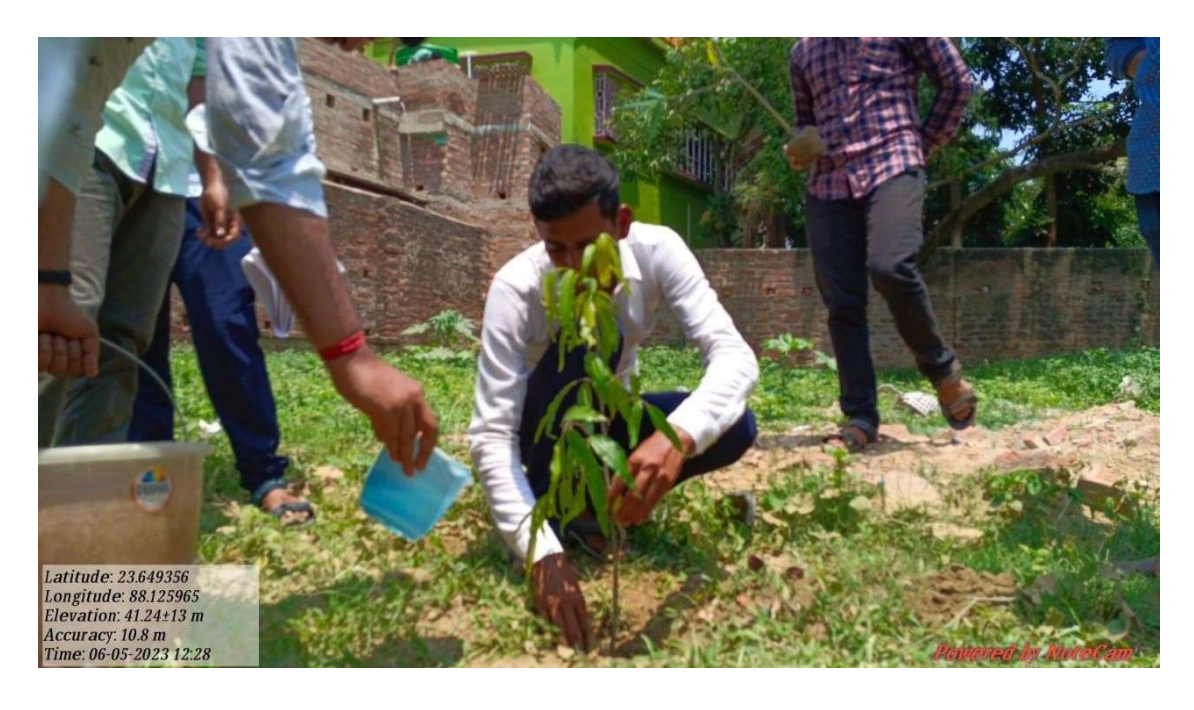
Fig: 21 (up) 22 (down)

(Affiliatedto theUniversityofBurdwan) Principal's Office, P.O.: Katwa,Dist.:PurbaBardhaman,WestBengal,PIN:713130,India. Mobile: +918101078393 ॥विद्यया विन्दतेऽमृतम् ॥