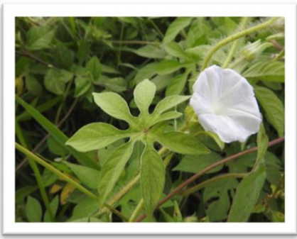
11. Ipomoea pes-tigridis