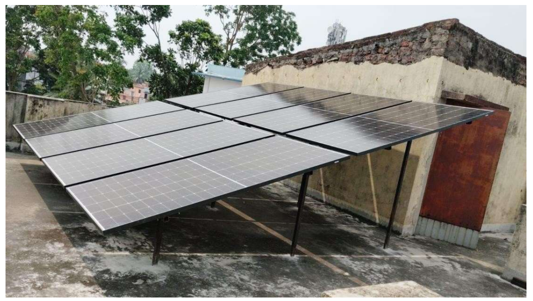
Fig: 7 (up) and 8 (down)

After quite long anticipation, Solar Panels have been installed at the rooftop of main administrative building. To reduce the enormous pressure on thermal power source this noble initiative was taken by the college authority in April 2024 and since then it is functioning very well. Solar panels at present are serving the administration only.