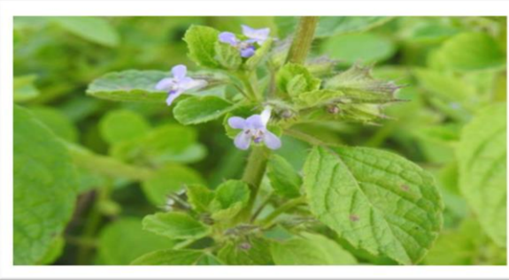
4. Hyptis suaveoľens