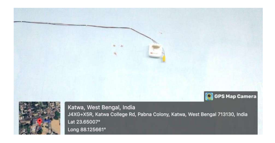
Fig: 11 (up) and 12 (down)

(Affiliatedto theUniversityofBurdwan) Principal's Office, P.O.: Katwa,Dist.:PurbaBardhaman,WestBengal,PIN:713130,India. Mobile: +918101078393 ॥विद्यया विन्दतेऽमृतम् ॥