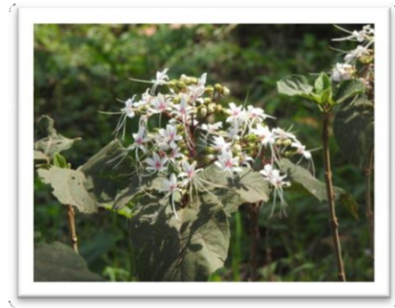
9. Clerodendrum viscosum

(Affiliatedto theUniversityofBurdwan) Principal's Office, P.O.: Katwa,Dist.:PurbaBardhaman,WestBengal,PIN:713130,India. Mobile: +918101078393 ॥विद्यया विन्दतेऽमृतम् ॥