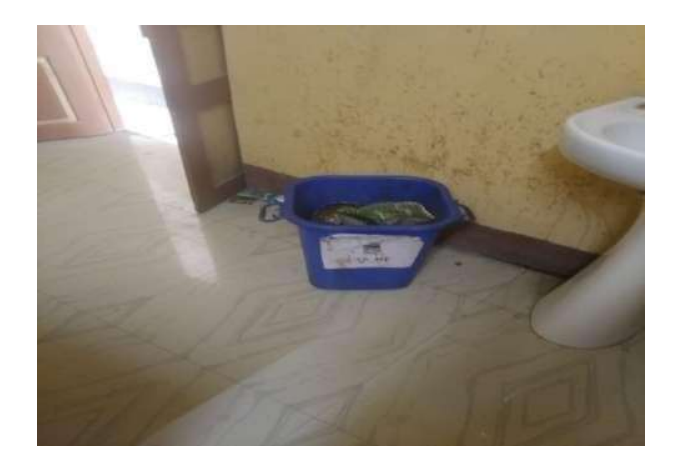
Fig. 13 : Solid Waste

(Affiliatedto theUniversityofBurdwan) Principal's Office, P.O.: Katwa,Dist.:PurbaBardhaman,WestBengal,PIN:713130,India. Mobile: +918101078393 ॥विद्यया विन्दतेऽमृतम् ॥