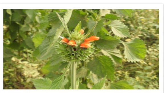
5. Leonotis nepetifolia