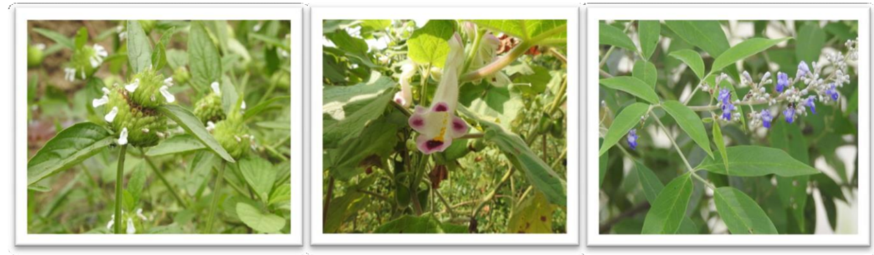
Signature of the Principal