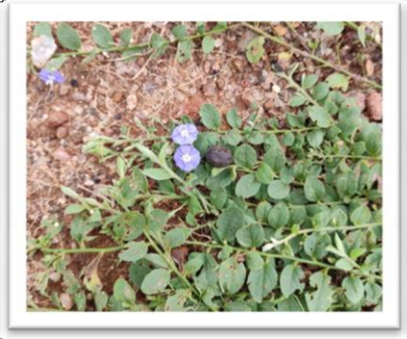
10. Evolvulus alsinoides